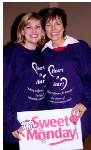
Fellowship Community Church, Salem VA February 2008